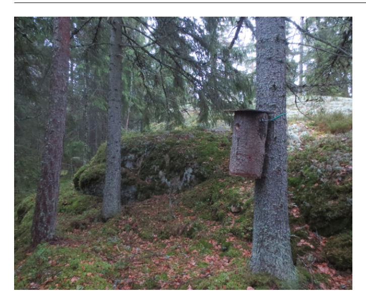
Figure 1–A typical flying squirrel nest box in Finland. Nest boxes are designed to resemble natural cavities.